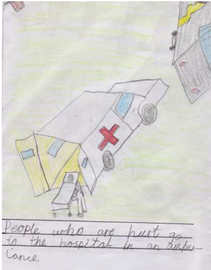
Third grade ESL wrote and illustrated stories.