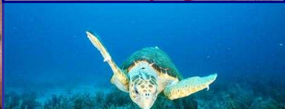
Grade 4 The Loggerhead Sea Turtle Project - February 2008